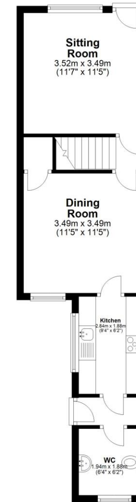
Ground Floor Approx. 39.6 sq. metres (425.9 sq. feet)